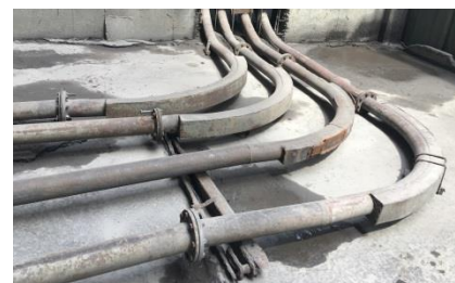
Reinforced Concrete Pipe