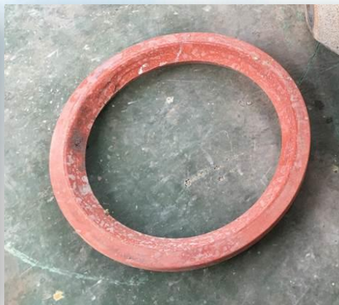
Corroded Rubber Seal Ring