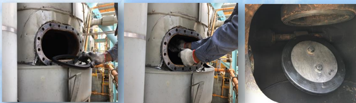
Flap Damper: Replacing New Packing