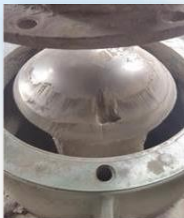
Corroded Spherical Valve